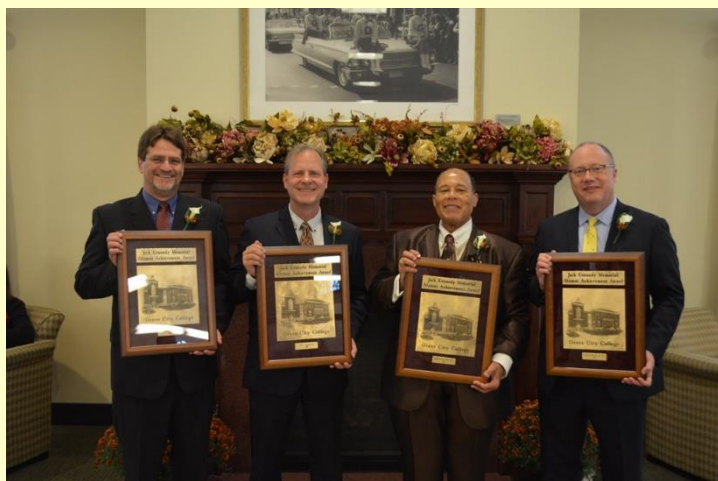
Recipients of the 2018 Jack Kennedy Memorial Alumni Achievement Award. See the GCC Awards website for more details about the recipients: alumni.gcc.edu/awards