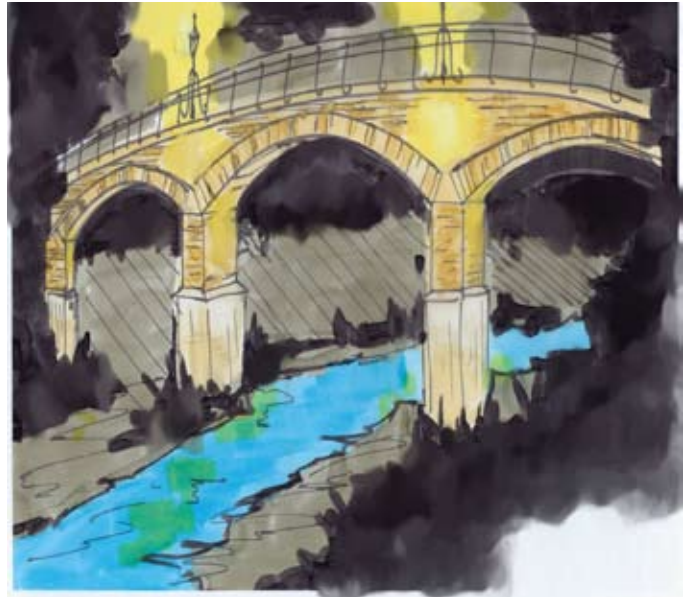
Rainbow Bridge lighting