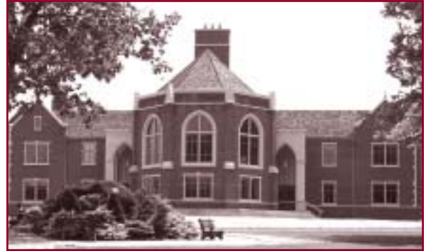
Student Activities Center

Summer has come to Grove City with lots of spring and early summer rain. The grounds are emerald and the buildings are as beautiful as ever. One building is brand new and just a few weeks from being finished. It is the new Student Activities Center (SAC), pictured here, located just in front of the year-and-a-half-old Hall of Arts and Letters. (Both new buildings straddle the location of the now razed Calderwood Hall.) The SAC has great utility for student needs and uses (the new food area will bear a familiar name – the Gedunk). It provides a dimension we never truly had and it will enhance the student experience for our 2,300 undergraduates. Its completion signals a trilogy of new dynamic space (the dramatic addition to the Pew Fine Arts Center, the spectacular Hall of Arts and Letters and the beautiful Student Activities Center), built from the results of our ongoing Change & Commitment Campaign. As I wrote in my last “Moment” piece about fundraising, the Campaign, which is about 90 percent complete, has been funded in very large measure from alumni gifts. And for that the Board of Trustees and the entire College family can never say thank you enough.