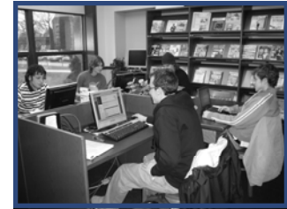
Career Services Library