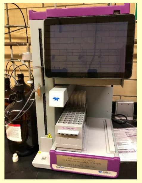
CombiFlash Nextgen 300 instrument is used for chromatographic separation of inorganic and organic mixtures.