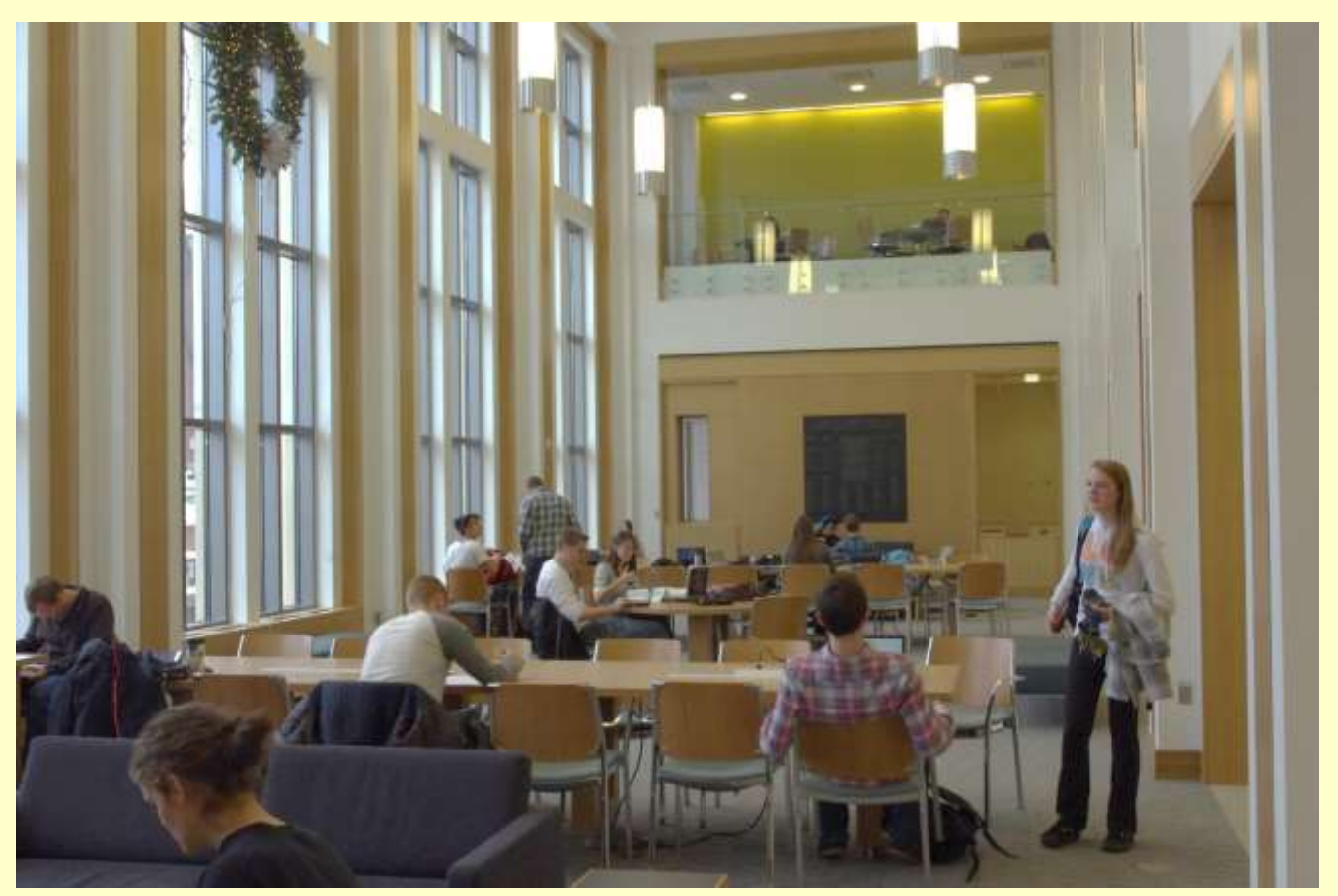
open Atrium located on the side of STEM facing the new Breen Student Union Building. You can see smaller spaces in the upper background that are off of the main hallway on the second floor. All of the tables have outlets for plugging in computers, and the entire building is a wireless hotspot.

Another key design feature of STEM Hall is the creation of spaces where students can congregate and work together on homework or research (or just to hang out together!). The main space is the two-story