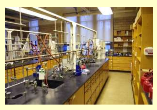
Also, Analytical Lab and its instruments remain in the basement.