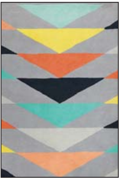
Land of Nod's Isosceles rug pairs the punch of a graphic motif with pastel hues and soft finish underfoot.